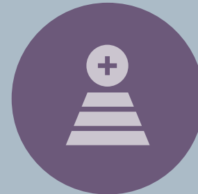
Elevate the Experience