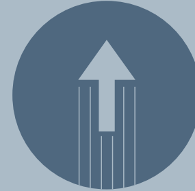
Increase Speed to Market

Achieve your vision for performance. Our human-centered, research-based environments improve the experience for your staff, patients, and their families because they are comprised of product solutions designed to optimize performance and reduce human struggle.