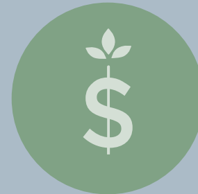
Optimize Your Investments